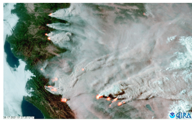
GOES-17 imagery of several large fires in northern California on Aug. 4, 2021.

GOES-U will provide critical atmospheric, hydrologic, oceanic, climatic, solar and space data for advanced detection and monitoring of environmental phenomena that threaten the security and well-being of everyone in the Western Hemisphere.