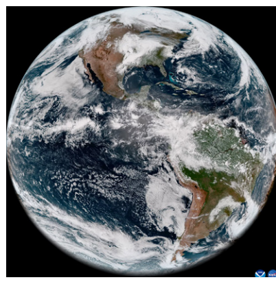
GOES-18 GeoColor full disk image from May 5, 2022.

NOAA's GOES-U is the fourth and final satellite in the Geostationary Operational Environmental Satellites (GOES) – R Series, the Western Hemisphere's most sophisticated weatherobserving and environmental-