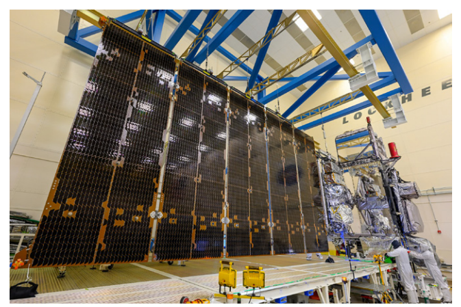
GOES-U satellite in a clean room.