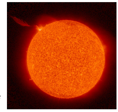
GOES-16 SUVI image of a large solar flare on May 29, 2020.

GOES-U hosts a suite of instruments that improve the detection of approaching space weather hazards. The Solar Ultraviolet Imager (SUVI) and Extreme Ultraviolet and X-ray Irradiance Sensors (EXIS) provide imaging of the sun and detection of solar flares. The Compact